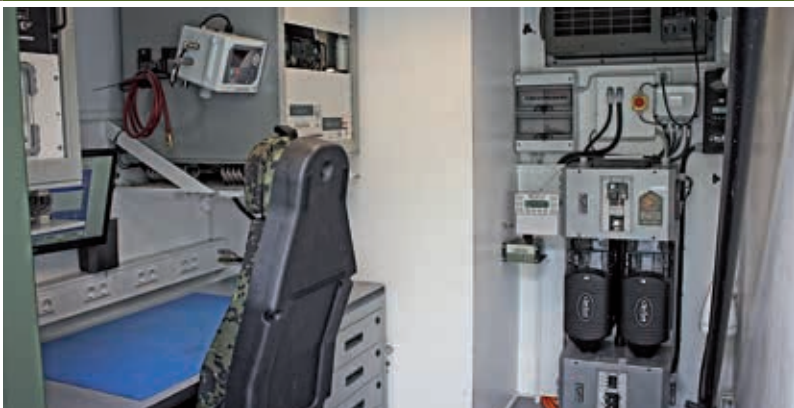
Mobile service and repair office