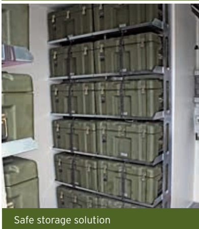
Safe storage solution