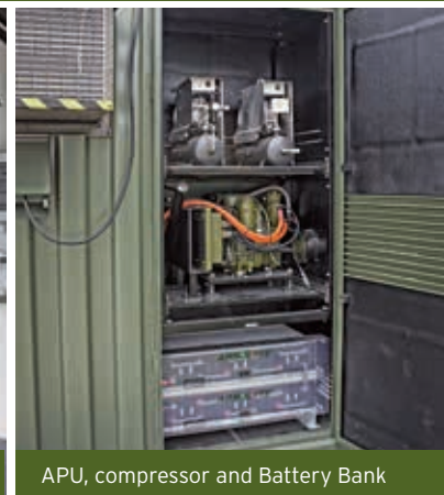
APU, compressor and Battery Bank

A/S Hydrema Gl. Kirkevej 16 DK-9530 Støvring