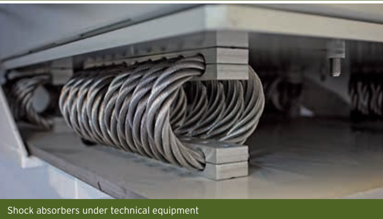
Shock absorbers under technical equipment