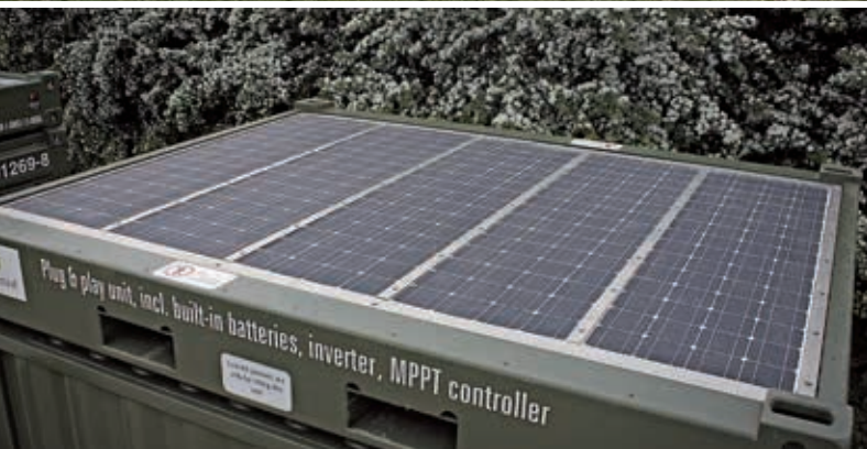
Integrated solar panels